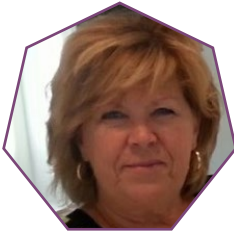
Elaine McGinn Desert Botanical Garden Phoenix, AZ