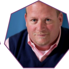
Thomas Hornsby Museum of Science & History Jacksonville, FL