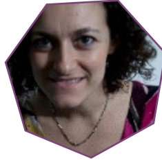
Chiara Bernasconi Museum of Modern Art Brooklyn, NY