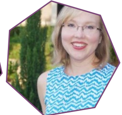
Holly Keris Cummer Museum of Art & Gardens Jacksonville, FL