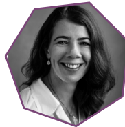
Jenni Wolfson Chicken & Egg Pictures