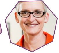
Hope McMath Cummer Museum of Art & Gardens