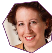
Jill Snyder Museum of Contemporary Art Cleveland