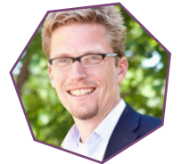
Children's Museum of Denver