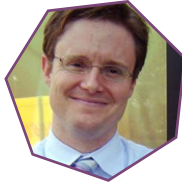
David Flatley Center for Community Arts Partnerships at Columbia College