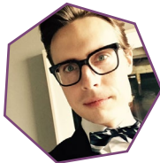
Lane Harwell Dance/NYC