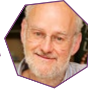
Richard Penny Watershed