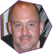
Tanner Methvin Africa Centre