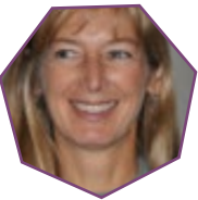
Peggy Sloan North Carolina Aquarium at Fort Fisher