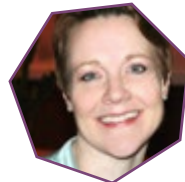
Rachel Moore Music Center