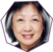
Tisa Ho Hong Kong Arts Festival