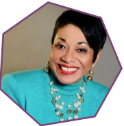
Zenetta Drew Dallas Black Dance Theatre