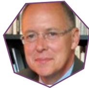
Charles Desmarais San Francisco Chronicle