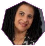
Suzan Jenkins Arts and Humanities Council of Montgomery County