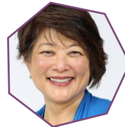
Beth Takekawa Wing Luke Museum of the Asian Pacific American Experience