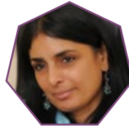
Basma El Hussein Culture Resource (Al Mawred Al Thaqafy)