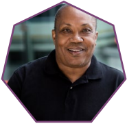
Neil Barclay Contemporary Arts Center