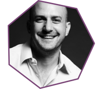
Vallejo Gantner Performance Space 122