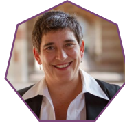
Kristy Edmunds Center for the Art of Performance at UCLA