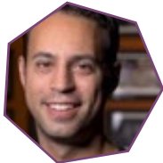
Greg Reiner National Endowment for the Arts