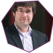
Wier Harman Town Hall Seattle