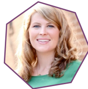
Teal Thibaud Glass House Collective