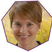
Kelly Pollock Center of Creative Arts