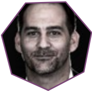
Terence McFarland Valley Performing Arts Center