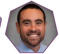
Geoffrey Kershner Academy of Fine Arts