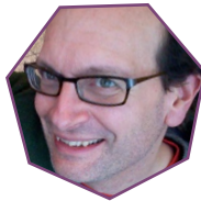
Art Rotch Perseverance Theatre