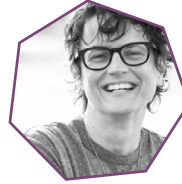
P. Carl HowlRound: A Center for Theater Commons