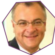
Steve Martin Childsplay