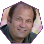
Ken Schutz Desert Botanical Garden